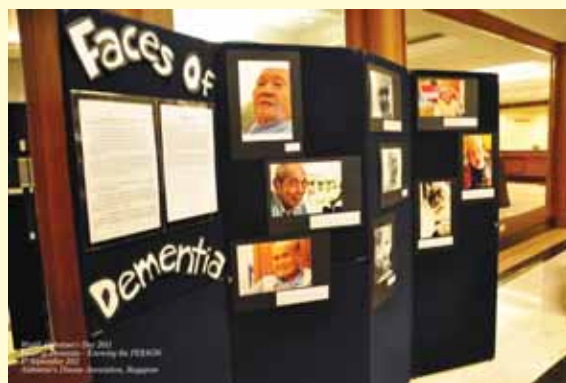
Submitted photographs to the 'Faces of Dementia' Photography Competition 2011 were also being displayed at the Forum for participants' viewing