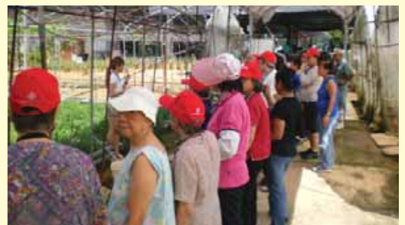
Clients and volunteers from the Centre touring the leafy vegetable farm of Kok Fah Technology Farm

NHC (Jurong Point) received the highest number of visitors from amongst the NHCs, mainly from the medical and educational institutions. The Centre also provided training attachments to 15 students namely from NYP, NNI, Nanyang Technological University and Monash University.