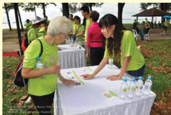
Participants are encouraged to solve various memory games at the booths along the walk