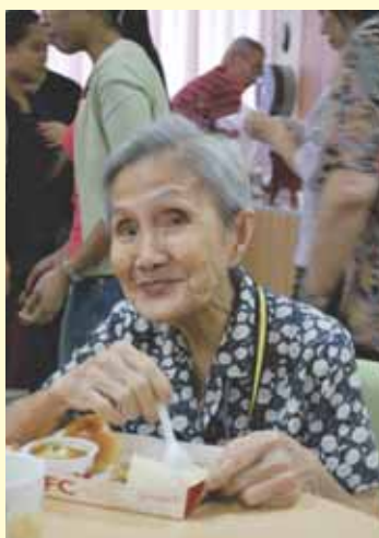
One of our clients from the NHC (Jurong Point) enjoying her Mooncake Celebration Lunch treat by Kentucky Fried Chicken