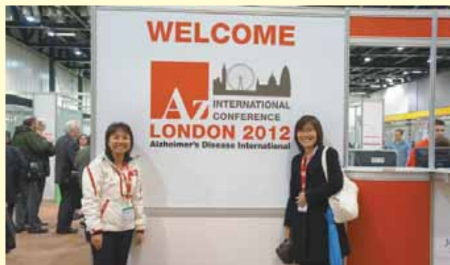
Two of our staff from the Caregiver Support Centre attended the 27th Alzheimer's Disease International Conference in London

During the year, staff members attended training courses, workshops and conferences organised by the Social Service Training Institute (SSTI), Agency for Integrated Care (AIC) Learning Institute, the Singapore General Hospital Post Graduate Allied Health Institute, Changi General Hospital, Tsao Foundation, The Law Society, Singapore Medical Association and ADA. These were on Person Centred Care such as the 'Sparks of Life Approach', 'Transforming Dementia Care', 'Mental Health First Aid', 'Using Creative Arts in Therapy', 'Medication Safety and Common Geriatric Complaints', 'Culinary Skills Training', 'Management of Constipation', 'Infection Control', 'Charities Accounting Standard', 'Communicating with the Elderly', 'Workplace Health and Safety', 'Initial Assessment in Physiotherapy', and 'Post Stroke Rehabilitation'.