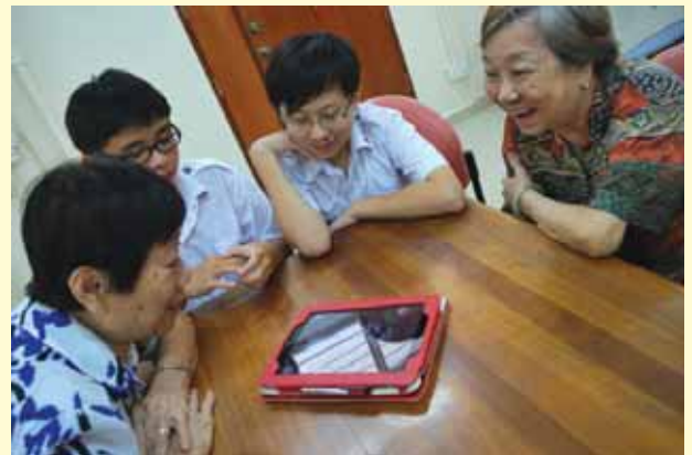
Guided by these students, clients from NHC (Bukit Batok) are trying their hands on the iPad