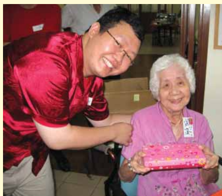
Eisai (Singapore) Pte Ltd and a client from NHC (Toa Payoh) celebrating Chinese New Year together