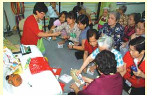
Shopping time! Engaging clients in an interesting way to help them use their remaining cognitive ability to manage money in this 'Pasar Malam' scenario.