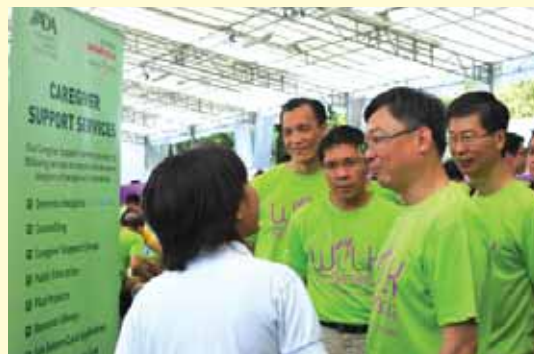
Sharing useful information such as the services offered by CSC with Minister for Health, Mr Gan Kim Yong and his entourage at the Memory Walk 2011.

The Centre also provided training attachments for three Diploma students, in Psychology and Gerontological Management from the Temasek Polytechnic, and would continue to do so.