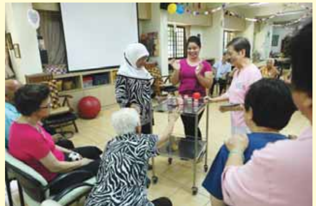
Clients from NHC (Tampines) trying their best to knock down all the bottles as part of their morning exercises