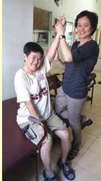
NHC (Tampines) provides both dementia and rehabilitation care to its clients.

The Centre also provided many opportunities for students, such as from Hwa Chong Institution, United World College Southeast Asia and the Prefect Council of East Spring School to carry out their community service involvement programmes.