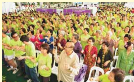
Participants taking part in the 'Conductorcise' activity.