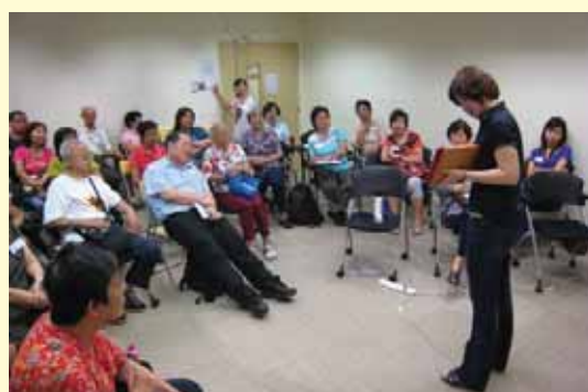
One of the training workshops by CSC for caregivers on mind activities for persons with dementia