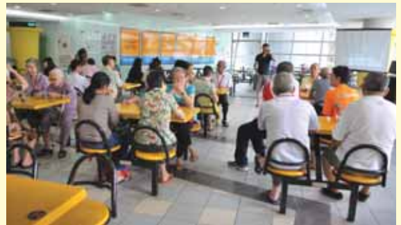
A lunch treat outing from Dignity Kitchen.

During the year, a total of 65 referrals were received, of which 32 were admitted. This was a slight increase from the 56 referrals received the previous year. There were also a total of 30 discharges over the year. As at 31 March 2012, the overall muster of clients stood at 84.