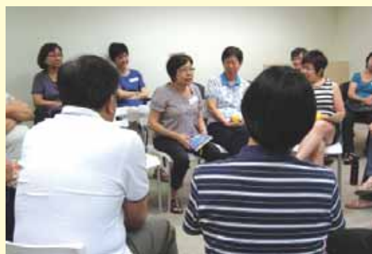
One of the Caregiver Support Groups and sharing sessions held in Mandarin at CSC (Tiong Bahru)