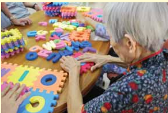
Slowly but surely, our clients trying their best to fit the given alphabets into the mat as part of a cognitive exercise.

The Centre was selected to initiate a pilot run of the Arts & Dementia project by ADA's PCC Steering Committee. Six clients were selected for a PCC tour of the Peranakan Museum on 7 February 2012 to actively engage persons with dementia through cultural tours and creative arts. Prior to the visit, much preparation took place in involving the Museum docents and our clients in familiarising with each other and engaging in conversations on Peranakan culture.