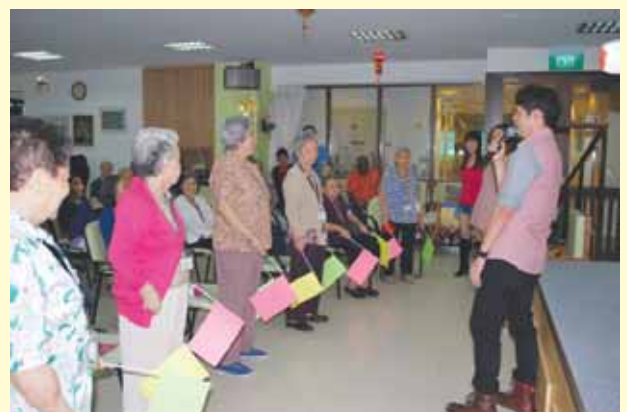
Deejays from Radio 100.3FM spreading cheer and joy in a Chinese New Year party at NHC (Jurong Point)