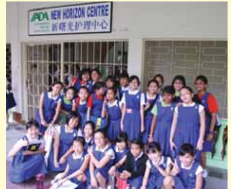
Students from CHIJ Primary (Toa Payoh) visiting NHC (Toa Payoh) for Community Involvement Programme

Other volunteers assisted ADA through their involvement as members in our 'ALZnewz' Newsletter Editorial Committee and the Person Centred Care/ Dementia Care Mapping Steering Committee, as facilitators and providing logistics support in our Caregiver Support Groups, as photographers, and helping out in many other various ways at our public education events. Community Involvement Programme School Volunteers continued to give their strong support, time and energy volunteering and spreading cheer at our Centres.