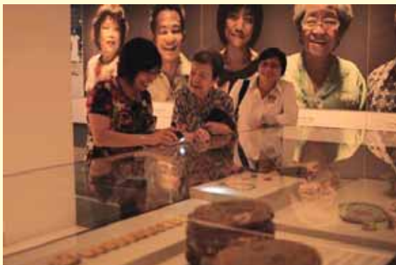
With the aim to engage persons with dementia through cultural tours and creative arts, six clients from the Centre were invited to tour the Peranakan Museum.