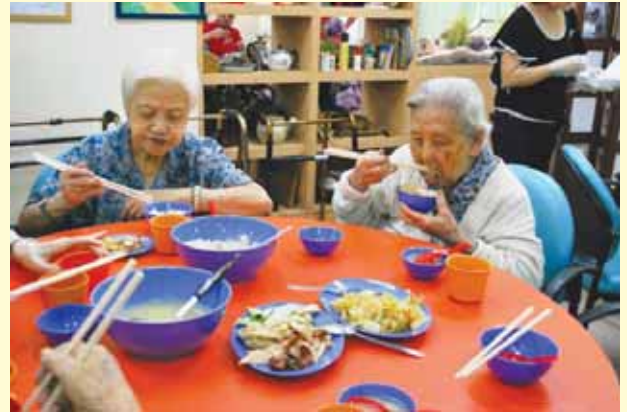
Communal dining for clients at NHC (Toa Payoh) as part of the Centre's approach to PCC

During the year, our Centres provided Community Service Order placements for 53 youths referred by the Ministry of Community Development, Youth & Sports (MCYS). We had also provided training attachments for 296 individuals and students, and would continue to do so, for the Nursing, Neuroscience, Gerontology, Medical, Social Work and Psychology students from various institutions such as the Institute of Technical Education (East College), Nanyang Polytechnic (NYP), National University of Singapore (NUS), Hua Mei Training Institute and care staff from the eldercare sector.