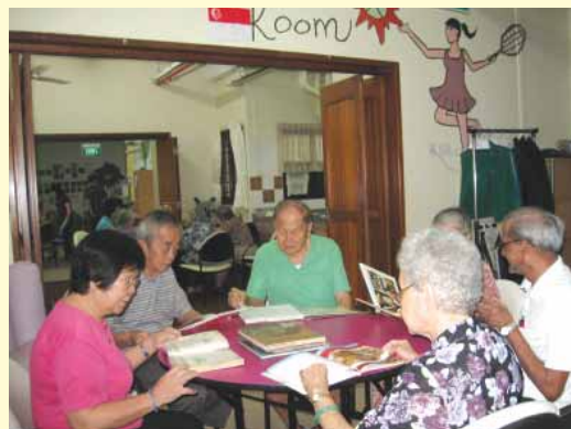
Clients who are avid readers look forward to their reading sessions, all thanks to the donated books by the National Library Board