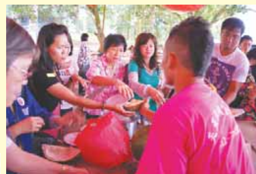
On 30 July 2011, staff, clients and their family caregivers, as well as volunteers enjoyed themselves eating durians at a Durian Farm in the 1- day trip to Johore Bahru