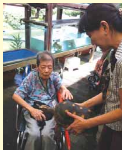
As part of the 'Extension of Day Care Hours', clients are brought to various interesting places such as the Turtle Farm in the west.