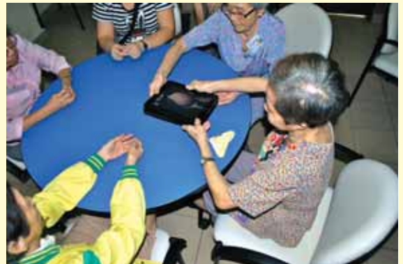
With enthusiasm, clients participated and played many interesting and engaging games via the use of iPads