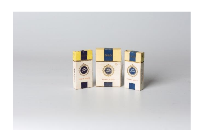
Copyright © Alzheimer's Disease Association (Singapore). All Rights Reserved.