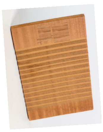
Copyright © Alzheimer's Disease Association (Singapore). All Rights Reserved.