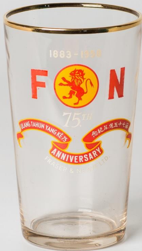
Frasier & Neave (F&N) drinking glass