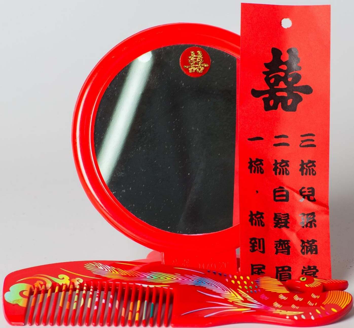
Chinese Bridal Wedding comb and mirror