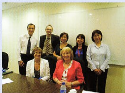
A visit by Lady Mayoress of London and British High Commission Singapore