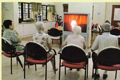
Clients responding and singing along to the SPT video played at the Centre

The Centre provided training attachments for 79 students pursuing courses such as the Advanced Diploma in Gerontology, as well as those for Neuroscience, Mental Health, Community and Social Service. This also included practical training for our Eldersit programme.