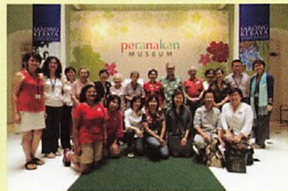
A group photo of clients, staff, volunteers and docents from the Peranakan Museum