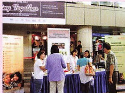
ADA's booth at a dementia community event organised by TTSH and HPB