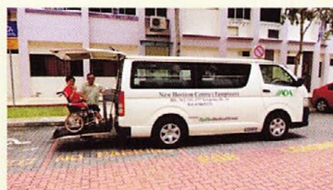
Donations from Raffles Medical Group enabled NHC (Tampines) to procure a vehicle to fetch clients to and from the Centre