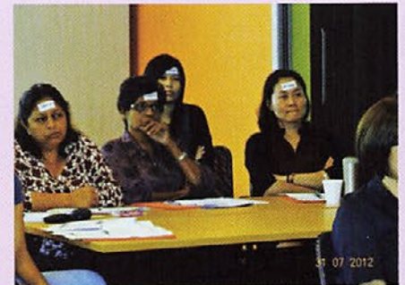
Staff also attended training workshops in Dementia PCC