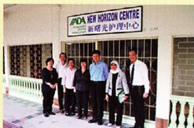
NHC (Toa Payoh) received Ministerial visit in May 2012