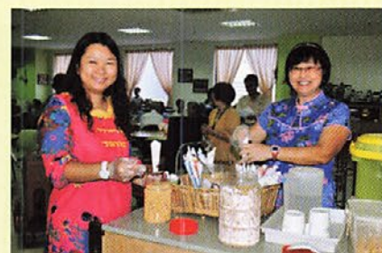
Our cheerful volunteers preparing "Kacang Putih" for clients before the start of an event