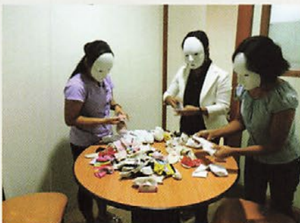
Role-play is introduced as part of experiential learning in the training workshops for domestic helpers

The Centre also provided training attachments for four students pursuing courses in Psychology and Social Sciences from the Polytechnics.