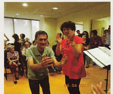
Having fun at an activity for clients during a typical CSG Eldersit Service