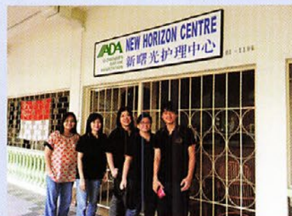
Officers from the AIC visited our NHC (Toa Payoh)