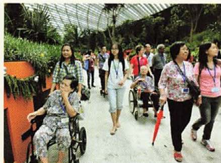
Our dedicated volunteers and clients from the the Saturday Extension Programme at Gardens by the Bay