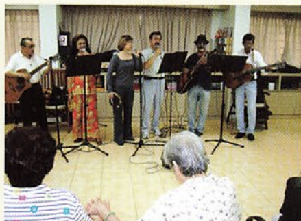
Volunteers strumming their guitars and singing oldies songs to entertain our clients at NHC (Tampines)