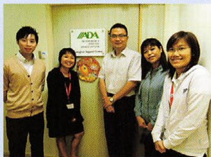
Visitors from the Macau Alzheimer's Disease Association at our CSC (Tiong Bahru)