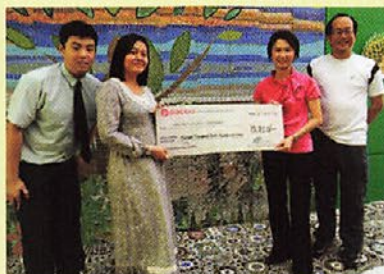
Receiving the donated cheque at Hillgrove Secondary School