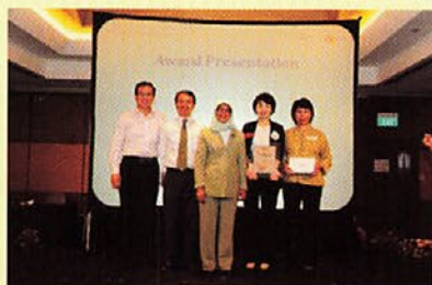
ADA won the NCSS Outstanding VVO award for Innovation (People's Choice) at the NCSS Members Conference 2012

Overall, our NHCs provided 331 training attachments to individuals and students from various institutions, namely the Institute of Technical Education (East College), Nanyang Polytechnic, Temasek Polytechnic, Ngee Ann Polytechnic, National University of Singapore (NUS), Hua Mei Training Academy, TSAO Foundation and eldercare sector care staff.