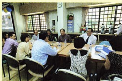
ADA's Management Committee sharing their future plans with Mr Gan Kim Yong and Dr Amy Khor.

As at 31 March 2013, the Centre's register of clients listed 56 clients. There were 27 referrals, 21 admissions and 26 discharges. The Centre also provided Community Service Order placements for 18 youth referred by the Ministry of Social and Family Development.