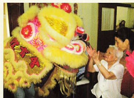
During the Chinese New Year celebrations, clients were treated to a lion dance performance by Eisai (Singapore)