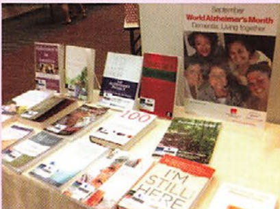
A wide collection of books on dementia care by NLB at ADA's WAD public forum

Our public forums had attracted the attention of the wing of James Cook University (JCU) that is based in Singapore, to organise a Public Lecture entitled Healthy Ageing: What science tells us about protecting your brain & managing your risk of dementia on 11 October 2012. ADA was invited to share on its services and programmes for persons with dementia and their family caregivers.