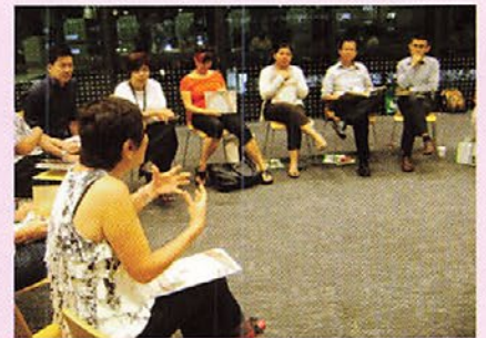
Participants at the NLB's Book Discussion held on 21 September 2012