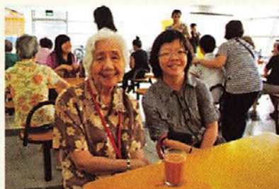
A lunch treat for the elderly sponsored by the Dignity Kitchen